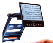
Video Magnifier/ CCTV

Auditory supports, such as listening to books, may be used with any literacy medium.